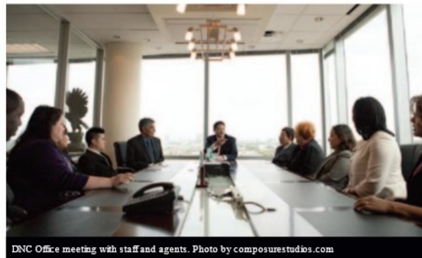
DNC Office meeting with staff and agents.